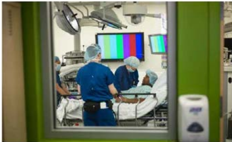
A donor is prepared in an operating room before a kidney transplant at Johns Hopkins Hospital on June 26, 2012.

Share 607 Like 2.3k Tweet 221 S EMAIL PRINT COMMENT 42