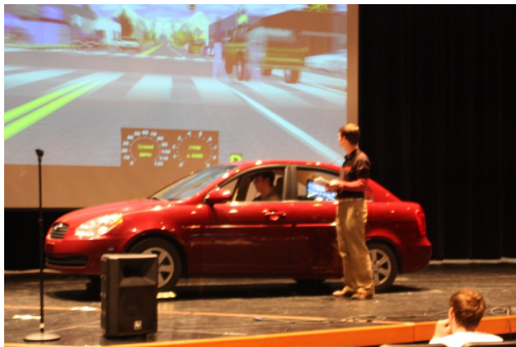
Marshall Area Traffic Safety Coalition sponsored a distracted driving presentation and driving simulator at the Southwest Minnesota State University.

The Southwestern Region has three active traffic safety coalitions: Kandiyohi Safe Communities Coalition, Marshall Area Traffic Safety Coalition and South West Central Safe Communities Coalition. These coalitions work at the local level to implement projects in partnership with local law enforcement which educate the public on preventing fatal and serious injury crashes. The coalitions target their projects at teen drivers, parents, college students, young adults, and the general public. The main areas they work in are: seat belts, impaired driving, distracted driving, and speed. Representatives from each coalition also are members of the Southwestern MN TZD Steering Committee.