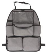
Back Seat Organizer