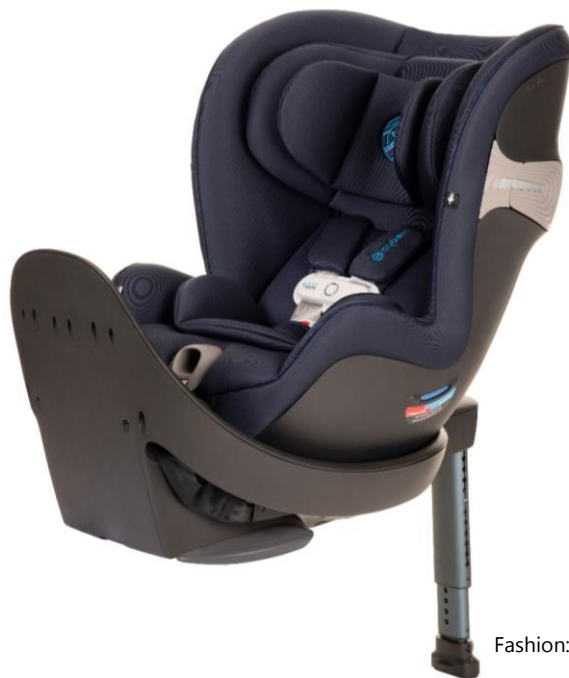
Fashion: Indigo Blue