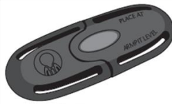
Chest Clip Transmitter