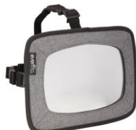
Back Seat Mirror