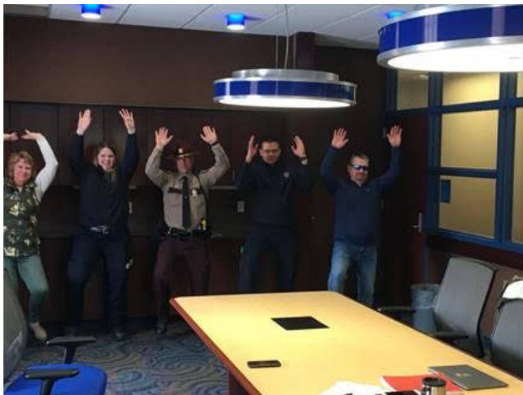
E's participating in a TikTok Video at TTZD Conference in Northwest Minnesota, March 2020

The purpose of this handbook is to provide an informational resource to assist in developing a Teens Toward Zero Deaths (TTZD) program in your local school, community, or region. This handbook outlines how to build the program as well as how to plan a regional conference. Regional conferences are designed to facilitate the implementation of TTZD in local communities and serve as a career exposition for students interested in the 4 E's: Education, Emergency Medical Services (EMS), Enforcement, and Engineering. The goals of the TTZD program are to encourage traffic safety as a priority for teens, provide a method to bring traffic safety programs into communities, share successes of the Minnesota TTZD program, build relationships between schools, communities and the 4 E's, and to network with other school and traffic safety advocates in the region.