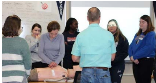
Trauma in the ER