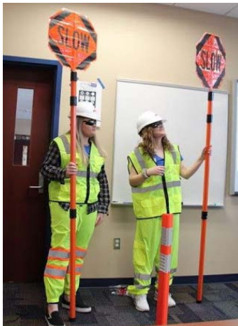
"Life" behind the orange barrels