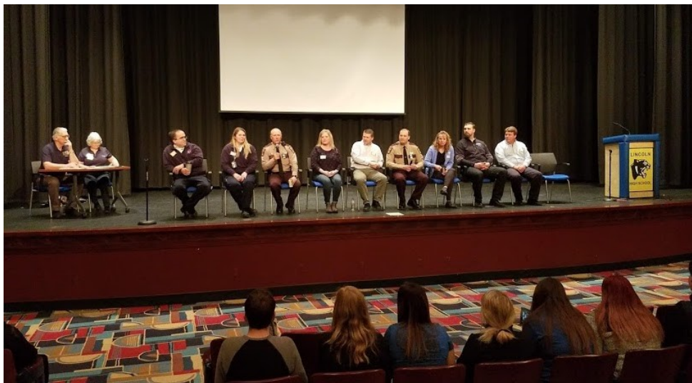
Members of the E's and Kiwanis during Round Table