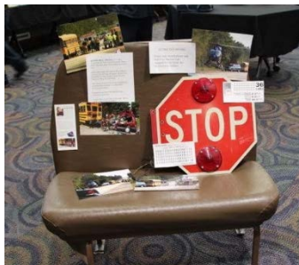
TTZD Conference Visual Aids