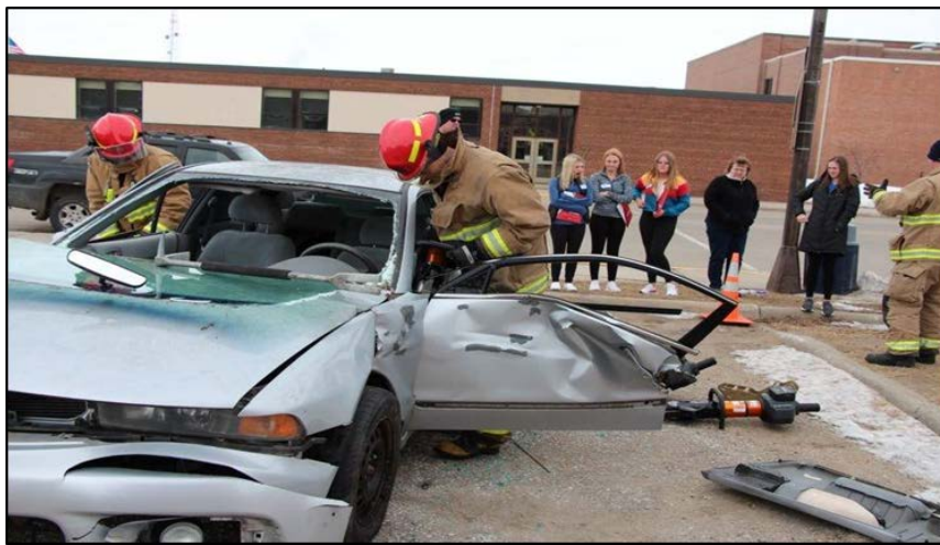
Bad Choice, Bad Crash. What happens next?