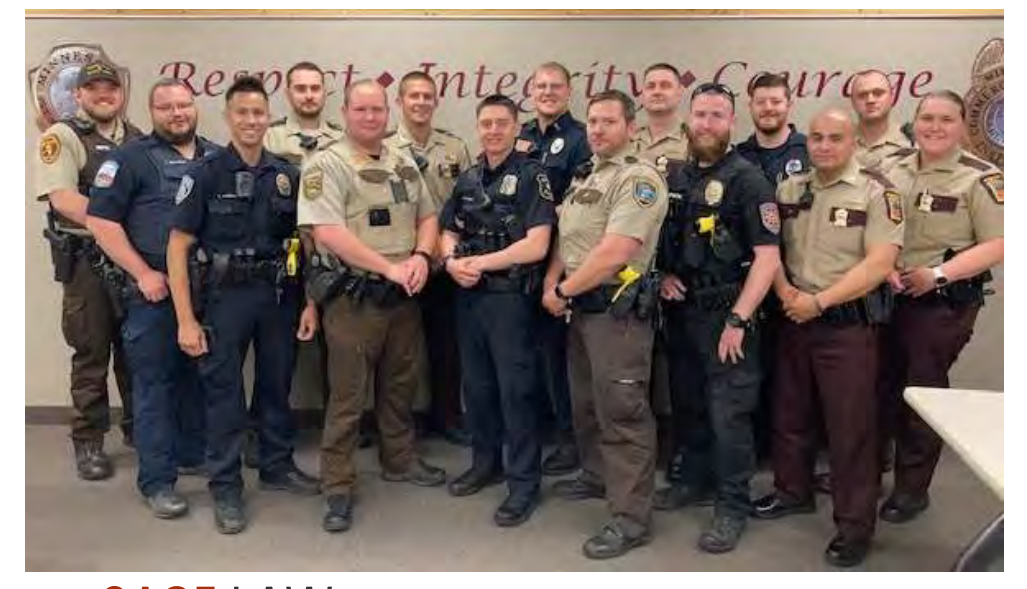
CASE LAW Minnesota Police Briefs (Vol. 36 No. 4)

The students will soon travel to Philadelphia, PA to complete their certifications.