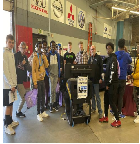
Educational Partnerships 2023