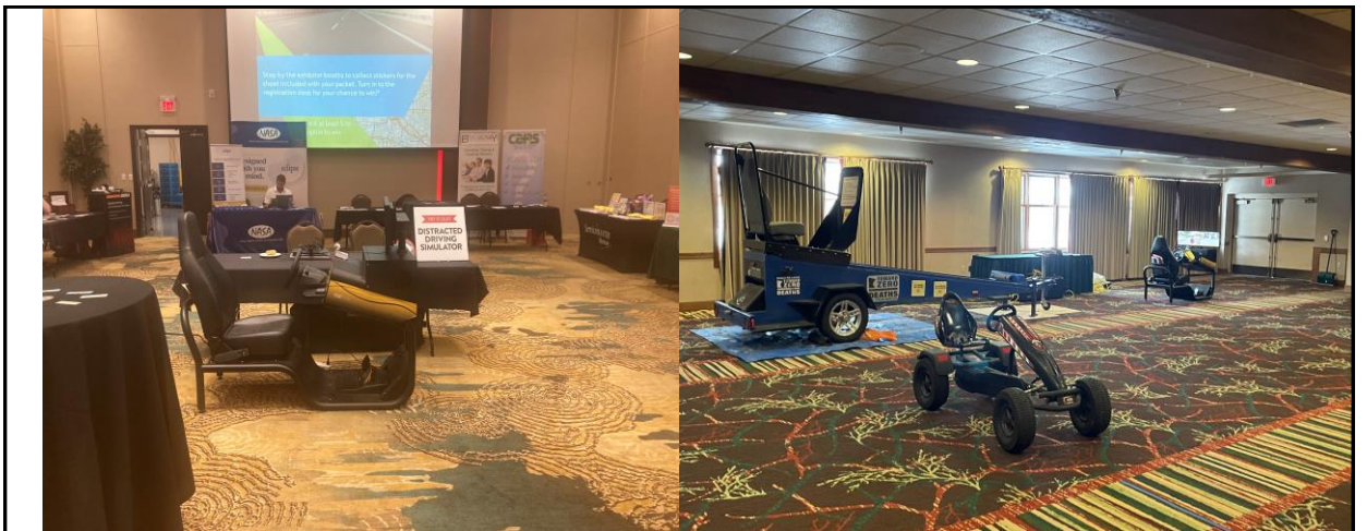
Business - related training 2023